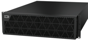
Battery pack: SRTG192XLBP4