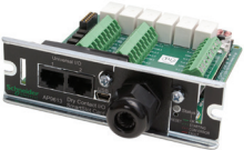
Dry contact card: AP9613