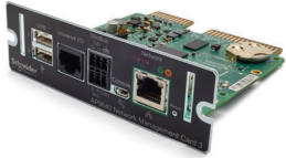
Network card: AP9643